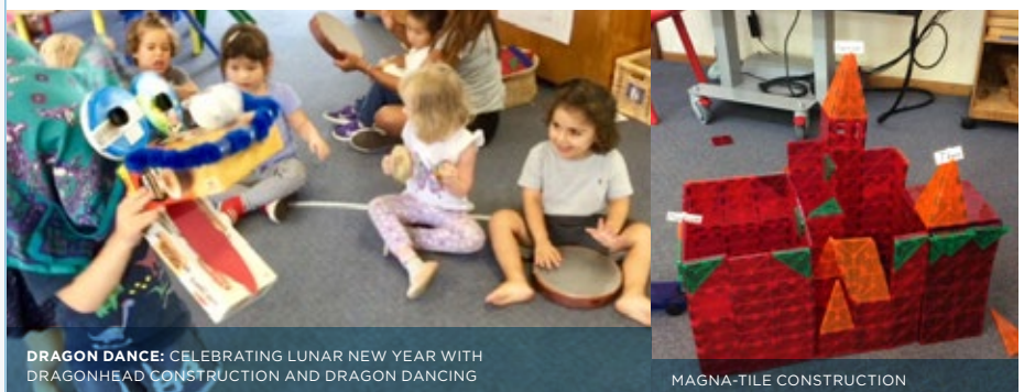
DRAGON DANCE: CELEBRATING LUNAR NEW YEAR WITH DRAGONHEAD CONSTRUCTION AND DRAGON DANCING