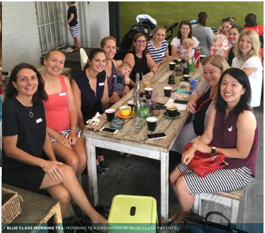
BLUE CLASS MORNING TEA: MORNING TEA ORGANISED BY BLUE CLASS PARENTS