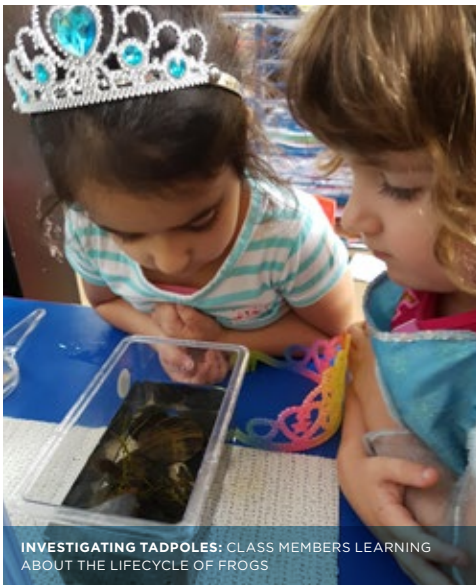
INVESTIGATING TADPOLES: CLASS MEMBERS LEARNING ABOUT THE LIFECYCLE OF FROGS

Currently, teachers, past parents and children are looking forward to our 2017 Reunion in the Park – more on that next time.