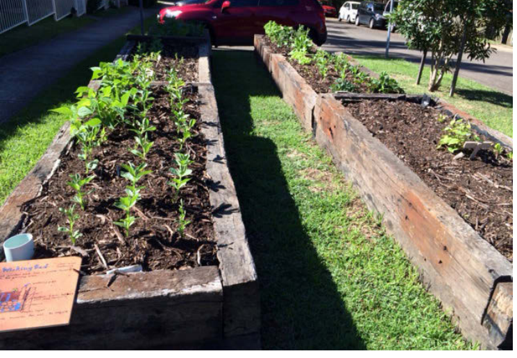
The new garden beds