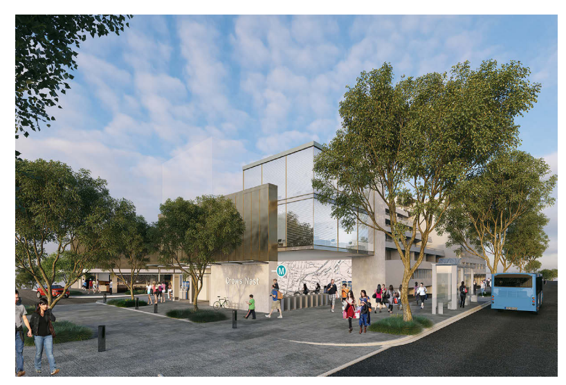
Artists impression of the Sydney Metro station at Crows Nest

There have also been a number of Community Consultation sessions held across the area, with remaining future sessions scheduled for 4-8pm on Wednesday 1st June at the Northside Conference Centre, cnr Oxley St & Pole Lane, St Leonards and also between 9am-1pm on Saturday 18th June at the Crows Nest Markets, Ernest Place, Crows Nest, as well as 10am-2pm on Saturday 4th June at Redfern Oval, 51 Redfern St, Redfern.