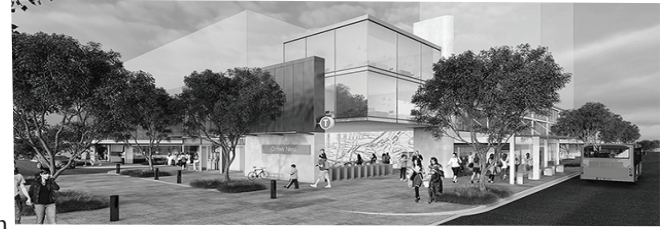
An artist's impression of the Crows Nest station.