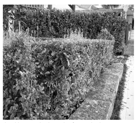
Looking south along the footpath shows another dimension to the hedges.