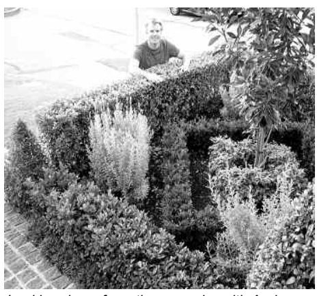
Looking down from the veranda, with Andy on the footpath admiring the hedged garden.